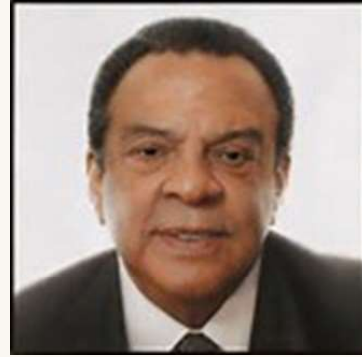
Young as Mayor of Atlanta

• In 1981, after being urged by a number of people, including Coretta Scott King, the widow of Martin Luther King Jr., Young ran for mayor of Atlanta. He was elected later that year with 55% of the vote. As mayor of Atlanta, he brought in $70 billion of new private investment. He continued and expanded programs for including minority and female-owned businesses in all city contracts. The Mayor's Task Force on Education established the Dream Jamboree College Fair that tripled the college scholarships given to Atlanta public school graduates. In 1985, he was involved in renovating the Atlanta Zoo, which was renamed Zoo Atlanta. Young was re-elected as mayor in 1985 with more than 80% of the vote. Atlanta hosted the 1988 Democratic National Convention during Young's tenure. He was prohibited by term limits from running for a third term. During his tenure, he talked about how he was "glad to be mayor of this city, where once the mayor had me thrown in jail". Young advanced interracial cooperation to improve education and increase prosperity, to encourage Atlanta's growing diversity and make it the headquarters for 2500 international companies and always to pave the way for the next generation of African American leaders.