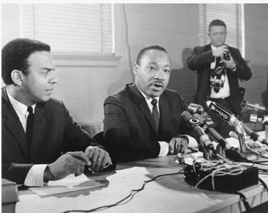
As a colleague and friend of Martin Luther King Jr., he was a strategist and negotiator during the Civil

• Enacted legislation that established the U.S. Institute for Peace and established the Chattahoochee River National Recreation Area, put an end to white-minority rule in Namibia and Zimbabwe (formerly Rhodesia). As UN Ambassador in 1978, Young travels to Kenya with George Schulz, Secretary of State; African American Institute