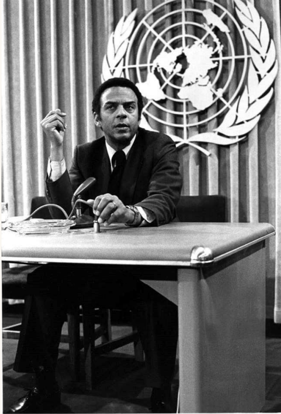
In the Carter Administration as US Ambassador to the United Nations

• After President Jimmy Carter took office in 1977 he appointed Andrew Young as the US United Nations Ambassador – he “helped shape both U.S. foreign policy and U.N. Consensus for greater emphasis on economic empowerment in developing nations around the globe” (W. J. Clinton). Mr. Young became the face of the administrations ambitious policy of engagement and inclusivity with developing countries and support for human rights around the world;